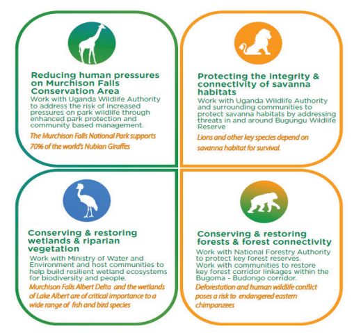
Figure 2: The Tilenga Biodiversity Programme Pillars for achieving Biodiversity Net Gain.

The Tilenga Project is operating in a Critical Habitat and is therefore committed to achieving biodiversity net gain within the Murchison Falls Protected Area which includes MFNP and the adjoining Bugungu and Karuma Wildlife Reserves, to enhance species populations, habitat quality and extent, while also improving tourism and livelihoods of communities. In consultation with UWA and other stakeholders, the company has identified four key pillars for the Program as described with the Project Biodiversity Action Plan. Each of these pillars has specific objectives to achieve the Tilenga Biodiversity Program vision: