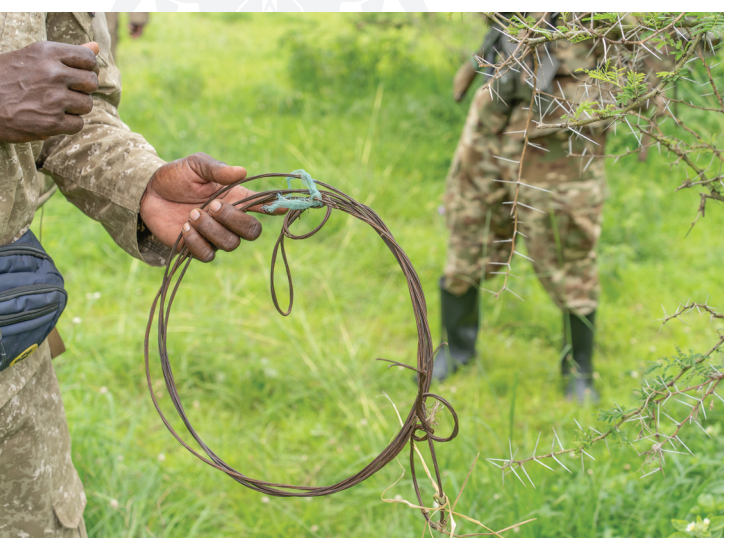
A wire snare dislodged and retrieved by an UWA ranger in Murchison Falls National Park

Rangers moving within a selected area and removing any wire snares and other kinds of traps encountered. Out of 52 patrols conducted within 8 months (March 2023), 1932 wire snares, 7 spears, 5 wheels traps, 16 canoes, 16 illegal fishing nets have been retrieved and arrested 47 poachers and rescued 3 wild animals live from wire snares.